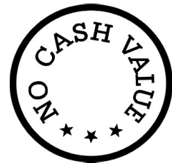
No cash value 4