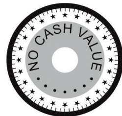
No cash value bi-metal 2