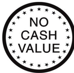
No cash value 2