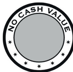
No cash value bi-metal 1