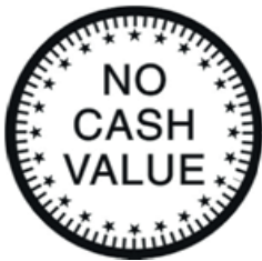
No cash value 1