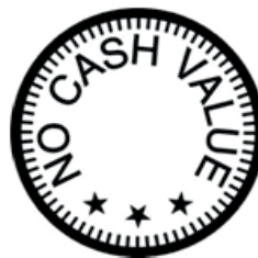
No cash value 3